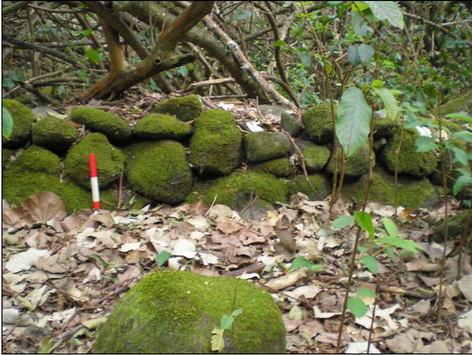
Figure 7. East wall of Feature 23. Orientation is to the east. The scale is marked in 10 cm increments.