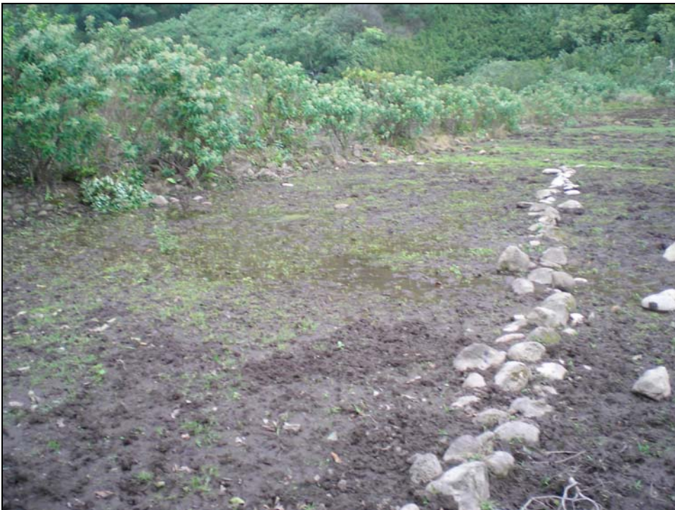
Figure 6. Feature 3, showing single-course wall ending abruptly in the marsh.