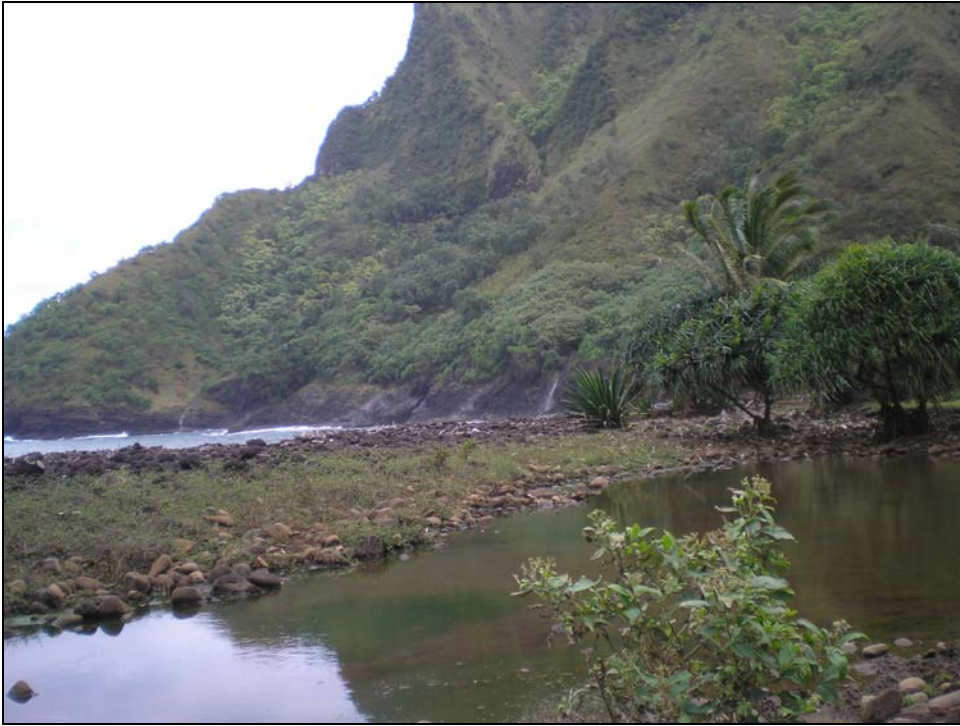
Figure 5. Standing pond on the north side of Feature 1. Orientation is to the northeast.