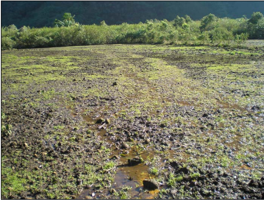
Figure 3. Open marsh of Feature 3. Orientation is to the east.