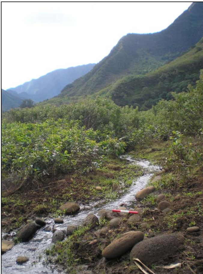
Figure 4. Outlet from Feature 1. Orientation is to the south. The scale is marked in 10 cm increments.