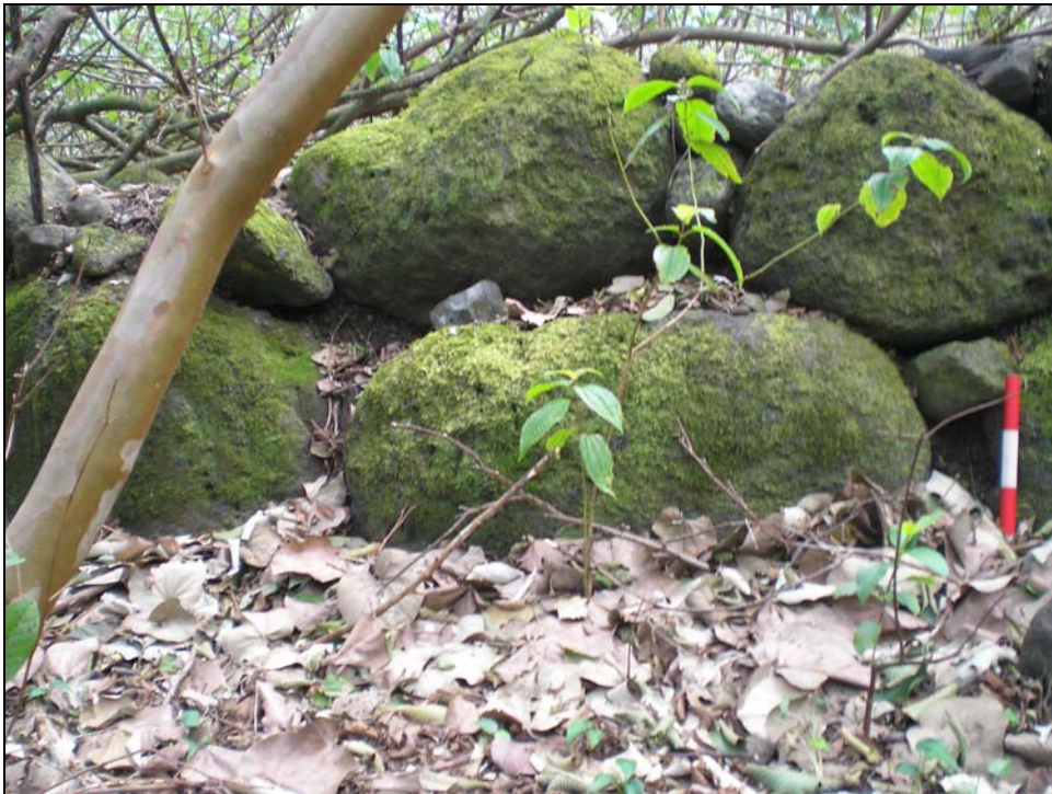
Figure 8. South wall of Feature 23. Orientation is to the south. The scale is marked in 10 cm increments.